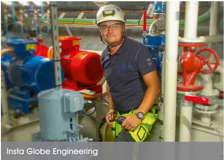
Insta Globe Engineering