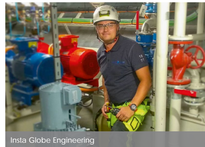
Insta Globe Engineering